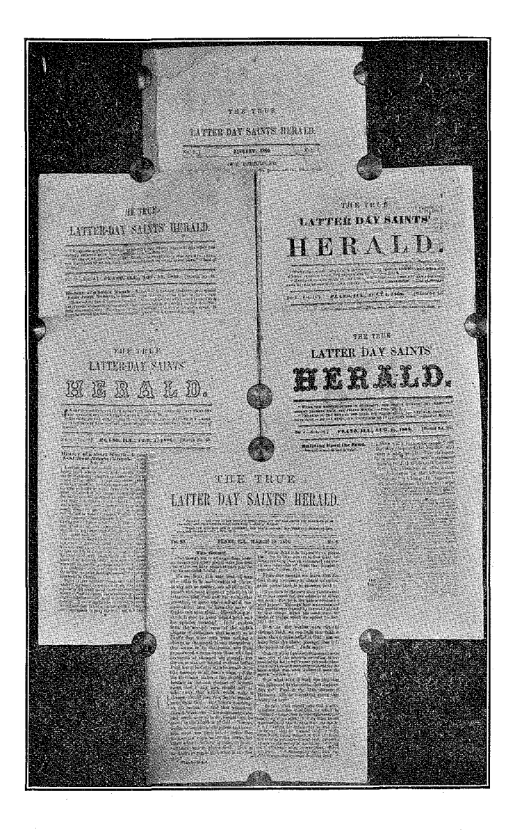
Showing the appearance of the Herald from the first issue until the change in size in 1877.